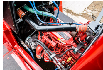
Easy Access to Drive Train & Hydraulics