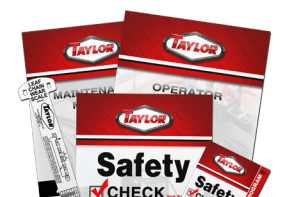
Vehicle Information Package "VIP" (Standard)