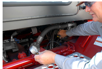
Service & Inspection from Ground Level