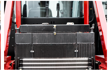
3-Section Bolted Radiator (Each section can be serviced separately)