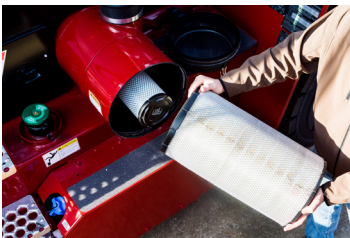
Donaldson Air Cleaner with Safety Element (Standard)