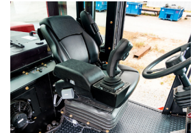
Fully Adjustable Air Suspension Seat (Standard)