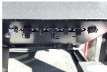
Heavy Duty Circuit Breakers/Reset Switches (Standard)