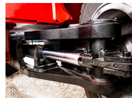
Industry's Toughest Steer Axle (Standard)