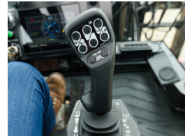
Multifunction Ergonomic Joystick (Standard)