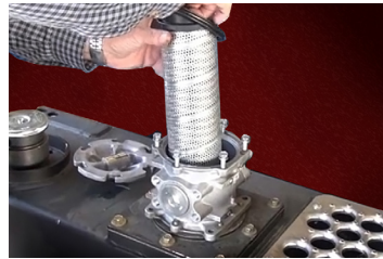
Spin-on Breather, Wire Mesh Strainer & Replaceable Internal Element (Standard)