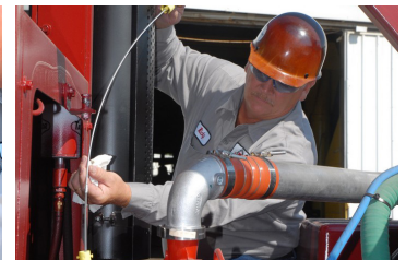
Easily Accessible Daily Checks