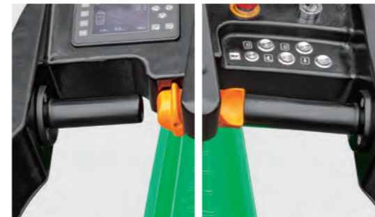
Left and Right Hand Operator Sensors