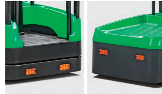
Front and Rear Flashing Lights